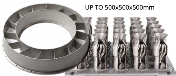
UP TO 500x500x500mm

Based on 3D Systems' proven precision metal 3D printing technology and GF Machining Solutions' technical and industrial knowledge and precision System 3R clamping systems, the DMP Factory 500 solution is an integrated platform with 3DXpert™ software, LaserForm® materials, workflow-optimized DMP production modules and expert application support. The DMP Factory 500 solution is engineered for uniform, repeatable part quality and high productivity in metal 3D printing with a low total cost of ownership (TCO) and smooth integration with traditional metal manufacturing processes. Function-specific modules are designed to maximize efficiency and optimize utilization.